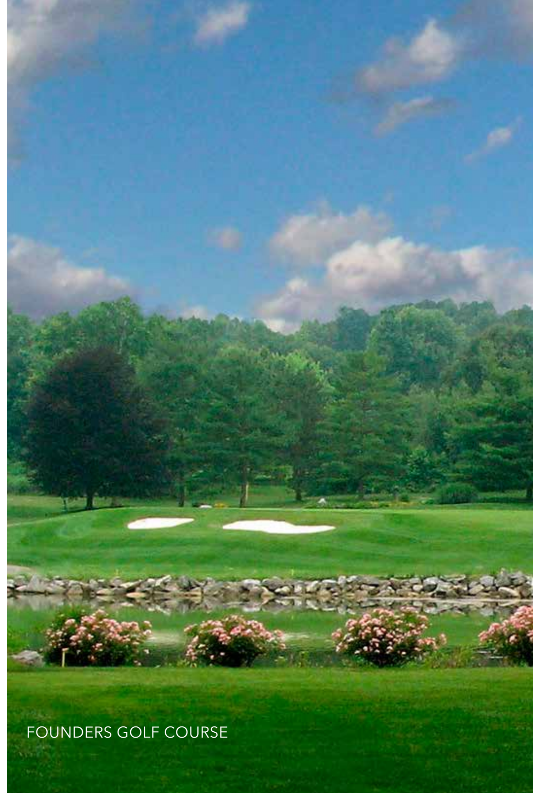
FOUNDERS GOLF COURSE

MULTIPLE GOLF GROUPS PROVIDE AN OPPORTUNITY TO MEET FELLOW MEMBERS. FROM THESE GROUPS YOU WILL MAKE NEW FRIENDS AND HAVE THE ABILITY TO MAKE OTHER GOLF GAMES FOR DIFFERENT DAYS OF THE WEEK.