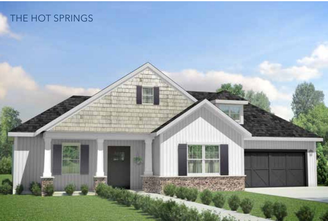
THE HOT SPRINGS