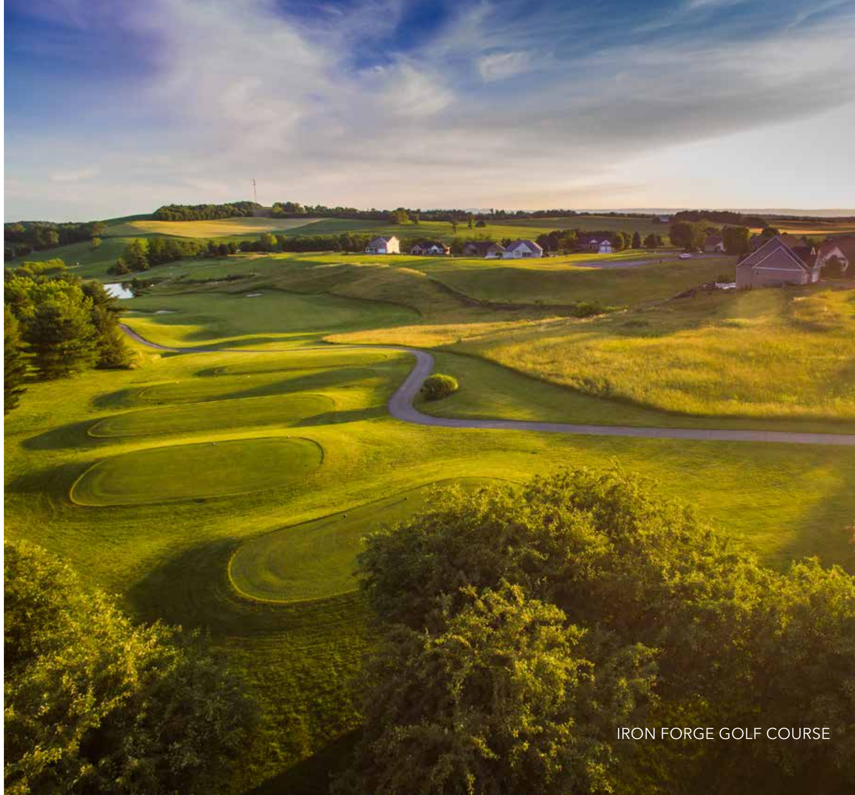
IRON FORGE GOLF COURSE